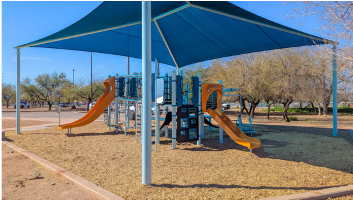
A modern children's playground with orange slides and blue climbing structures, covered by a large teal shade canopy, surrounded by wood chip ground cover and desert trees.

JACOBS PARK, Nicolas P. Ochoa Soccer Complex: 3450 N. Fairview Ave.