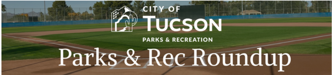
City of Tucson Parks and Recreation Parks and Rec Roundup banner with white text overlaid on a baseball field background showing green grass and infield dirt.