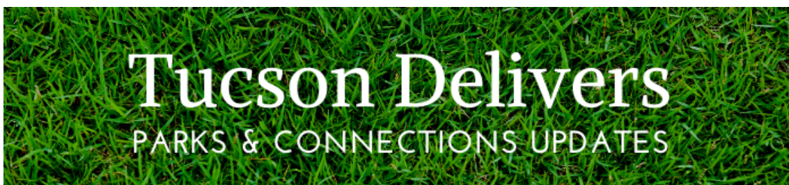
Tucson Delivers Parks and Connections Updates banner with white text on a green grass background.

In November 2018, City of Tucson voters approved Proposition 407, a $225 million bond package for capital improvements. The bond funds are dedicated to improving City park amenities (playgrounds, sports fields, pools, splash pads, and recreation centers) as well as connections (pedestrian pathways, bicycle pathways, and pedestrian and bicycle safety). For more information on all the projects planned and status updates, visit TucsonDelivers.Tucsonaz.gov .