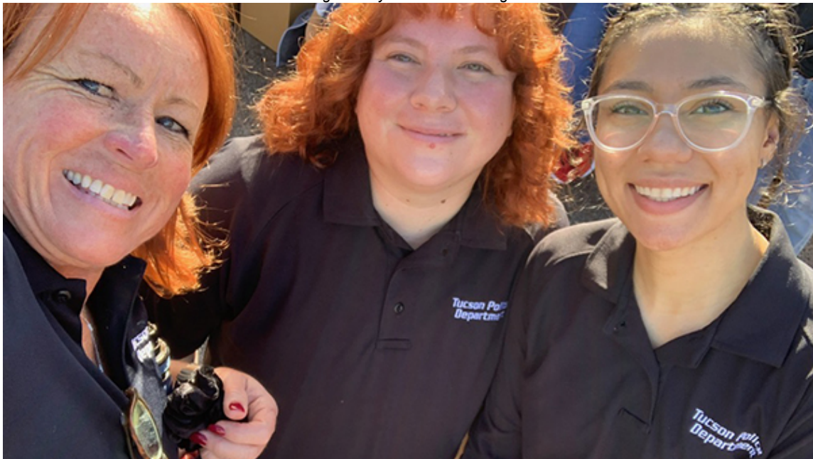
TPD members at the food giveaway - giving back feels great!