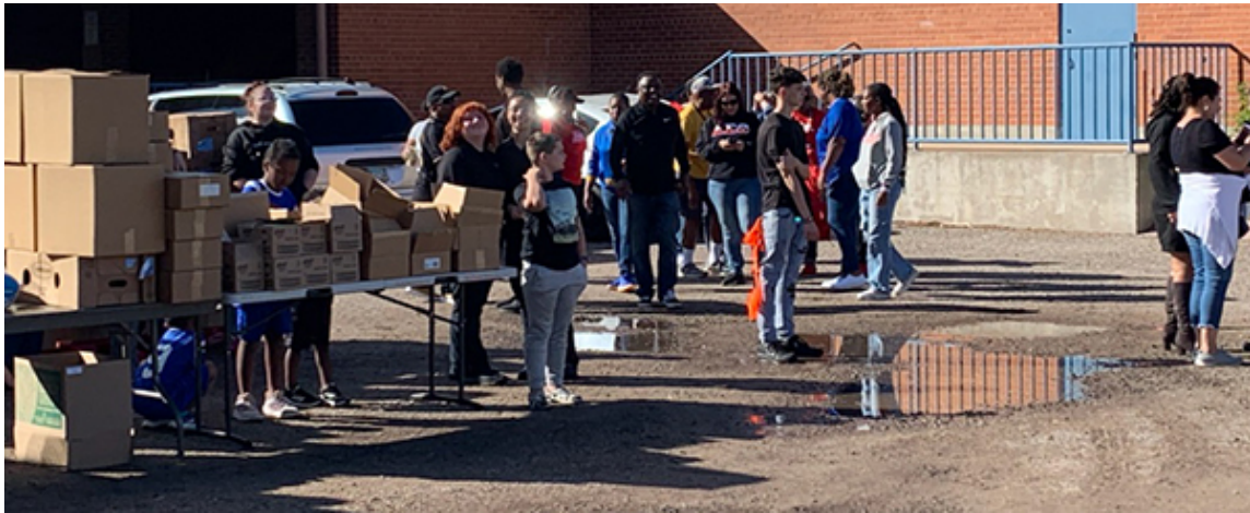
At the food giveaway at Palo Verde High School.